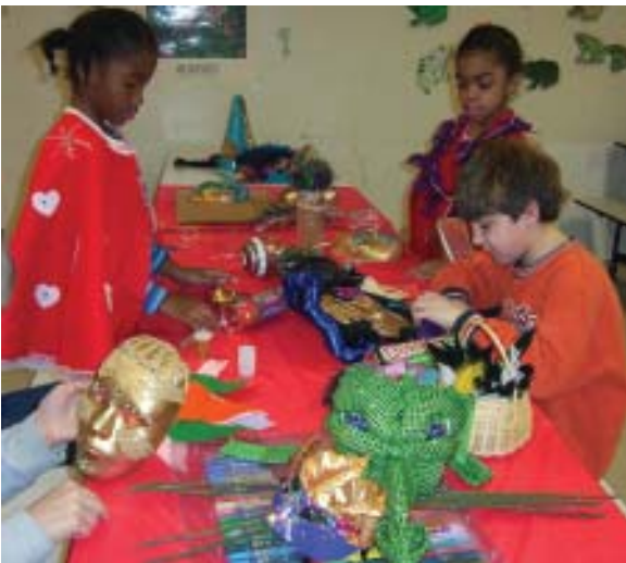
Students at IPS School 91 AYS created their own unique masks for the Mardi Gras Mambo parade.