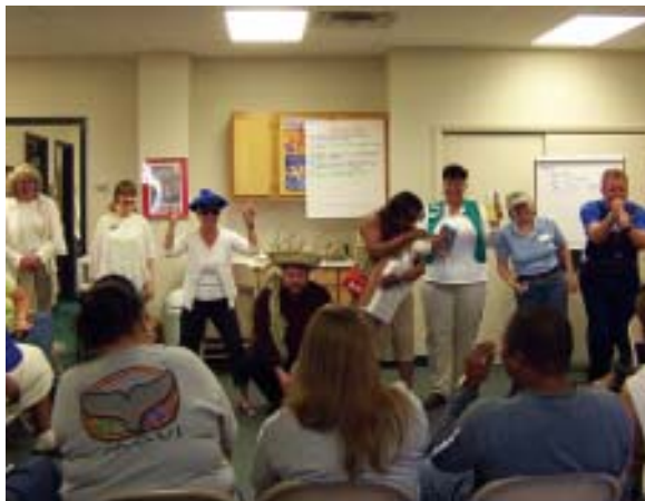
Trainers in the AYS Professional Development Center demonstrated the fun side of teamwork with Camp AYS staff.

AYS has been recognized for model programs by the Promising Practices in Afterschool Project, including training and retention efforts and a collaboration with Community Health Network's Health Promotion division providing a nurse consultant on staff.