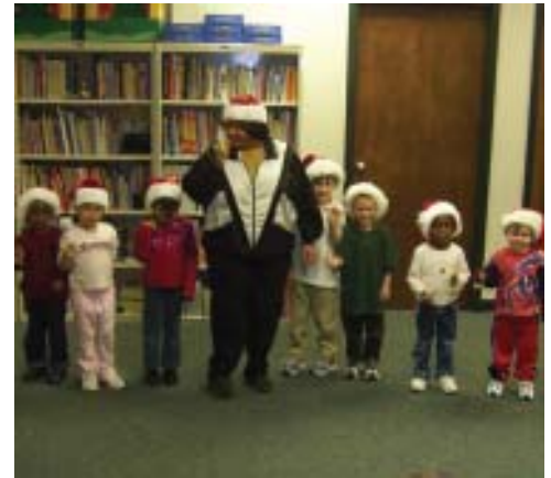
Children from the FMHPC early childhood program practiced coordination skills while spreading holiday cheer.