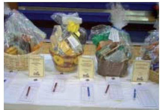
Donations by local merchants and individuals provided over 100 baskets in AYS' Bids for Kids silent auction.