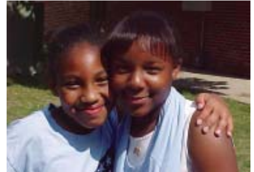
Participants at Camp AYS enjoyed an active summer while making new friends.

AYS' summer camps provide a safe, fun environment for children and youth throughout the summer. At Camp AYS, students explore a variety of activities. AYS partnered with Skyhawk Sports Camp at three locations this year. Arts Academy provides students with a unique, hands-on opportunity. A number of guest artists worked with the students throughout the summer. More than 800 children and youth were registered for AYS summer camps.