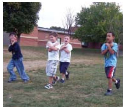
Students at Allisonville Elementary practiced staying fit throughout the year by playing games such as the "Monster Mash."